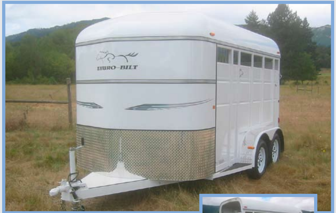
* Two Horse Model