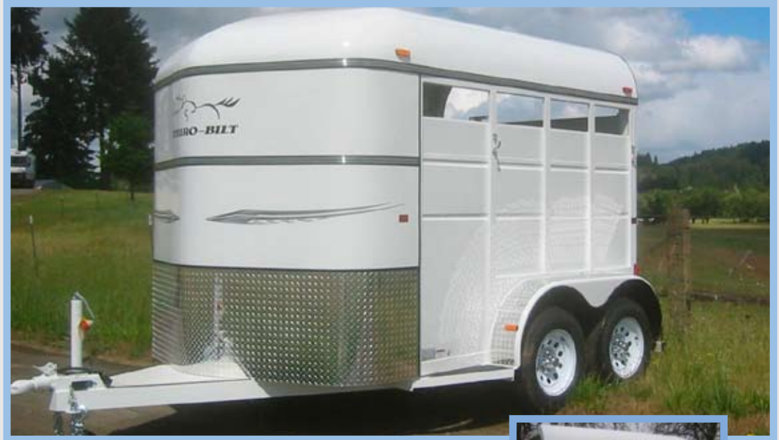
* Two Horse Model